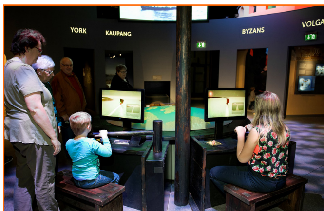
Figure 4. Viking navigators

I sit at the tiller of a Viking ship. It is the first time I've held one, and I move it right and left, just to check how much resistance it offers. I have a mission, to sail King Harald Bluetooth's wife, Tove, to Germany. She is on board the ship. I know she is not happy, but I cannot spare her any thought because the seas crave all my attention. Our ship breaks the waves, it trembles slightly, just as hesitant as I am. I try to concentrate on the route, which is laid out before me. We Vikings prefer to navigate by following the coast as much as we can but, of course, we cannot get too close. It is dangerous. We can also use the stars as guides, and by looking at the heavens and the coastline I can see my path very clearly. But steering the tiller is not easy, because when I turn it to the left, the ship turns in the opposite direction. And the coastline is tricky, bulging in and out as though it were a live thing. I need to get used to it. I am not in control. I am just riding the waves and the winds. But we will get there, we always do.