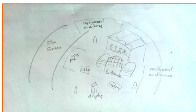
Figure 2. The "arena" room (approximate drawing from my field notes)

At the centre of it all is the arena, recreated inside a huge room, complete with rows of seats and a podium where the public can stand, and a big half-circular screen that shows a film of actual gladiator fights as if they were really in front of us.