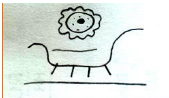
Figure 3. The chariot of the sun (approximate drawing from my field notes)

I am sitting on top of a burial mound. Night has fallen. The sky is covered in hundreds of tiny lights, some brighter than others: the stars. To my left I can see the woman. We whisper, in awe of her: she is a sorceress, a shaman. She has wild hair. She is naked from the waist up, and has painted the secret symbols of nature on her body. A snake rests, curled, around her arm. I am afraid of her, of what she can see, but when she speaks her voice is kind and deep. "I can fly like a bird. When I see the sun, I see..." She tells us of the sun and moon, of how the fish is the helper of the sun and pulls it down into the water at night. And when she speaks, her voice is magic and it paints figures in the air. I see what she is talking about, I see it written in light on the black sky. The disc of the sun pulled by the chariot and the stallion, the fish, the snake; how everything changes and then everything becomes the same, itself. And that is how we grow older and our crops are blessed. We are the people of the sun.